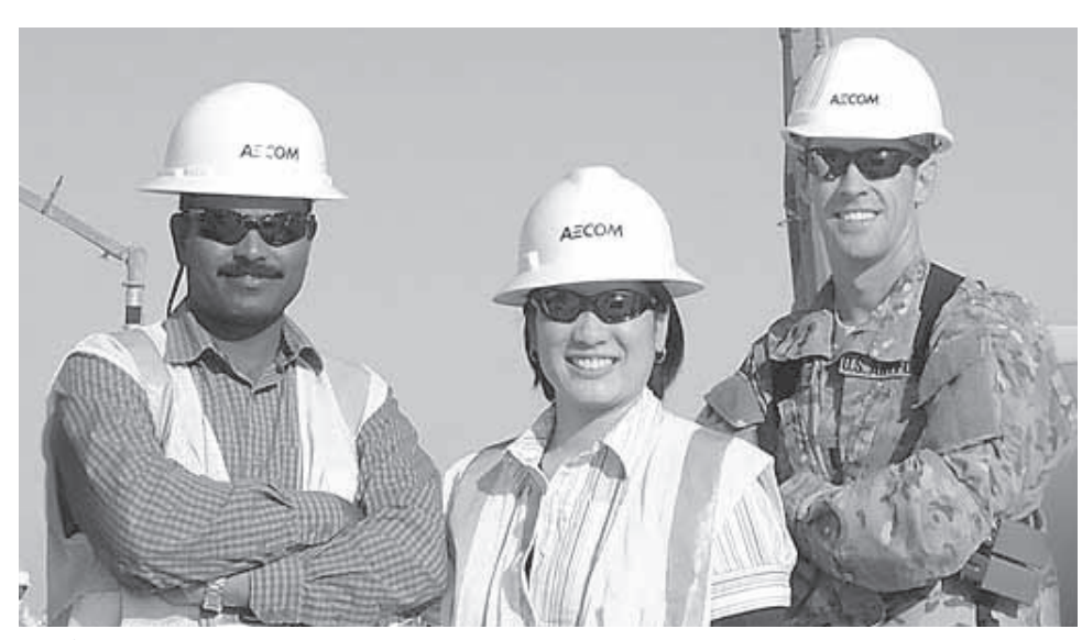
In Afghanistan, AECOM's team — including quality assurance and project management specialists — provided design, engineering, planning and construction support services.

AECOM's designers and engineers conribute vital services supporting people and missions at major U.S. Air Force installations worldwide, meeting the needs of the Air Force Civil Engineer Center's (AFCEC) programs for the past 25 years.